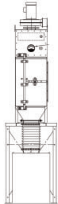
55-gal Drum Discharge Configuration