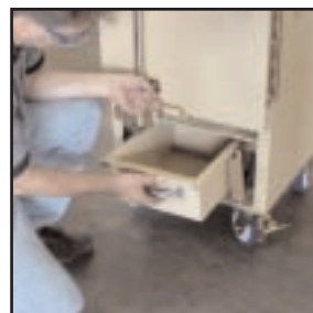
Tool-less, Quick- release Dust Drawer