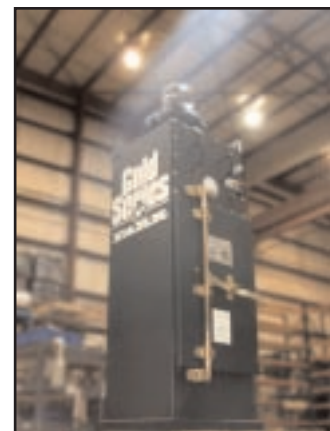
GS-Mini Bin Vent Configuration