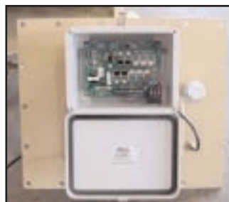
Optional Automatic Timer Cleaning System