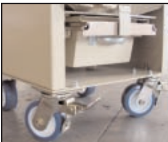
Optional Heavy Duty Food Grade Casters